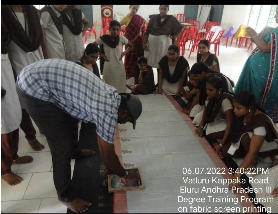
Trainer demonstrating the ways to print on saree using tools