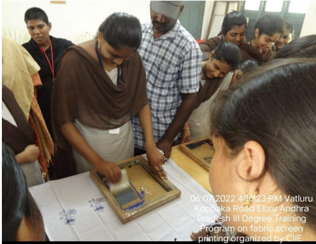
Students performing practical work on Fabric Screen Printing